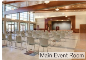
Main Event Room

The Harold E. Hofmann Community Center has four state-of-the-art rooms, one with full amenities, available for reservation for private functions such as: birthday parties, baby showers, wedding receptions, business meetings, family gatherings, formal dining events, etc. Whatever event you are having, the Harold E. Hofmann Community Center has a room that is made just for your event. The following spaces are available for reservation for large and small groups: